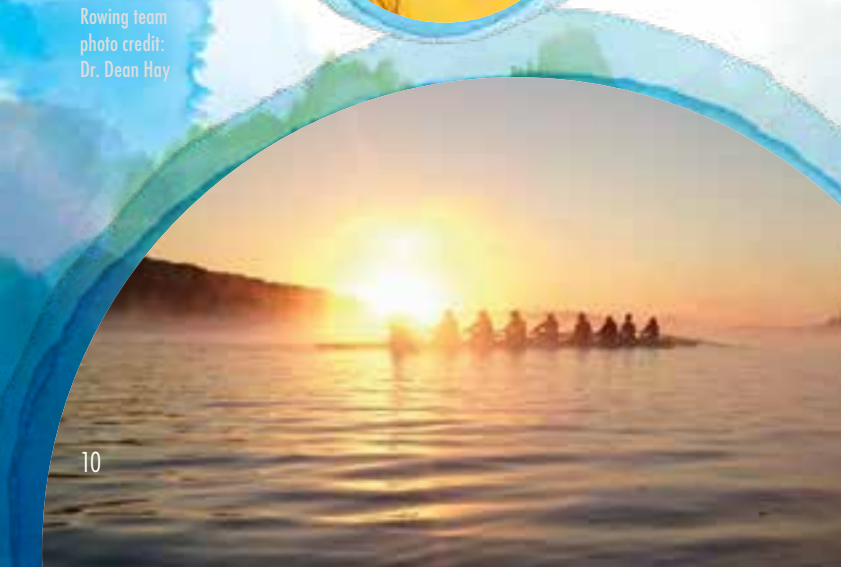
Rowing team